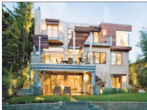
THREE LEVELS: A central circular stairwell connects the home. The rooms at the back of the house look out onto the pool and spa in the yard.