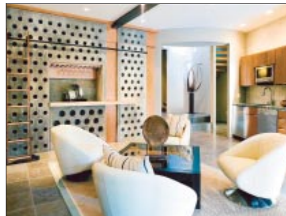
ENTERTAINING: The wine lounge features a chilled concrete wall that can hold 510 bottles. The lower level also has a screening room.